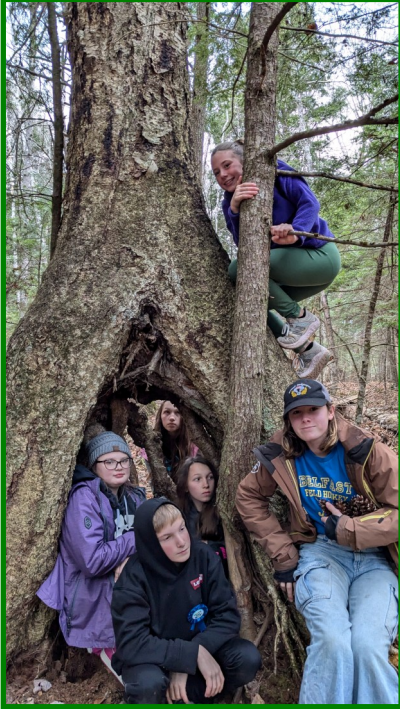
Students crowd "The Walking Tree" on the Hemlock Trail at Troy Howard Middle School.