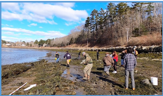
Students in the Marine Archaeology class record observations of an old shipwreck in the Passagassawakeag River.