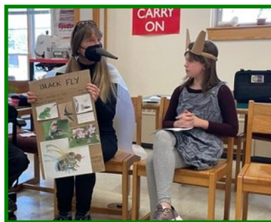
Black Fly Cloe Chunn and Rabbit Raleigh share their stories at last year's Council of Beings.

A grant from the Maine Community Foundation has enabled the purchase of journals, art materials, binoculars, guide books and hand lenses.