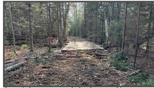
Large timber mats are used when heavy machinery crosses a stream or wetland area.

An October 29 auction of wind leases in the Gulf of Maine only brought two bidders.