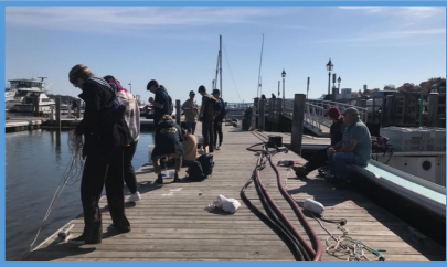
Students in the marine studies class take water quality measurements off the Belfast dock.

The Belfast Marine Institute (BMI) is a program in the Belfast Area High School in Belfast that offers nautical education for interested students. BMI offers a variety of marine-specific classes, such as a Marine Studies class that covers general oceanography, a Projects in Engineering class that educates students in all things engineering and allows them freedom and guidance to create their own inventions, and even a Sea Stories class that focuses on the literature of the ocean.