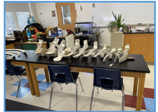
Vertebrae and ribs collected from the whale were assembled by students.