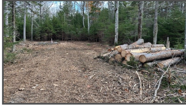
One of the test boring sites which are cleared to a 25 foot radius around the drilling location.

MDOT came in for heavy criticism from activist groups who were caught flat-footed by the tree clearing in November. "We didn't learn about it until after the work had begun," said Olsen, who received a text from a concerned citizen saying, "What's going on?" Olsen immediately drove to the island to investigate. He found contractors working with heavy equipment to build 12- to 14-foot wide access roads to seven locations for test bores.