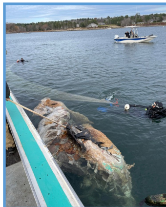
Scuba divers wrap a Minke whale carcass in netting to collect the bones for later study by students. In the background is the new BMI boat that was used to transport divers and materials to the site.