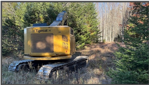
A timber harvester positioned at an entry point to the forest. 12 - 15 foot pathways were cut to access the site.

Then, in early November, contractors showed up to begin clearing access roads to test boring sites -- a public relations faux pas for MDOT, since irate citizens' organizations weren't notified before the work began.