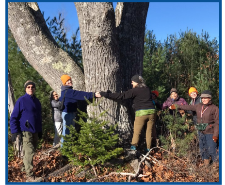
Hugging a grandmother Red Oak