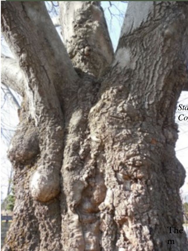
State Champion Copper Beech