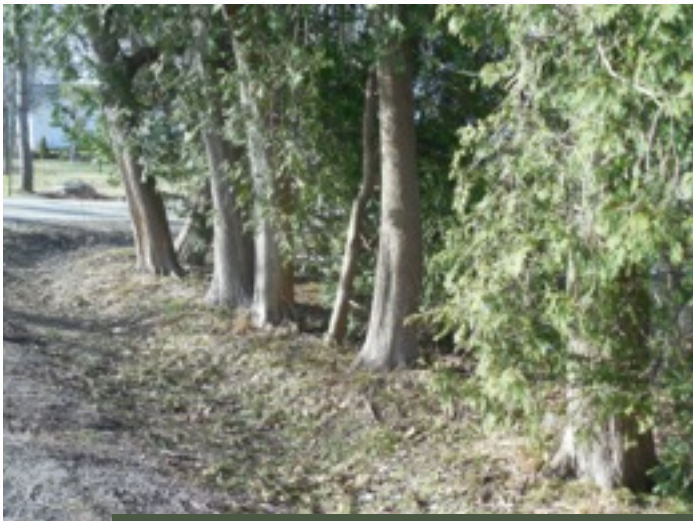
Cedars on Charles Street