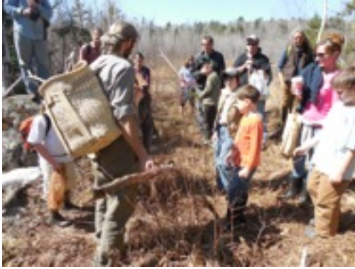
Wilderness Skills Hike in April, 2014

May 10, Sat. 7:00-10:00 am. Bird Walk on Sears Island. Meet at the end of the causeway to the island in Searsport. Bring binoculars, water, snack. Cosponsored with Friends of Sears Island.