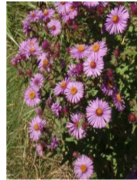
New England Aster