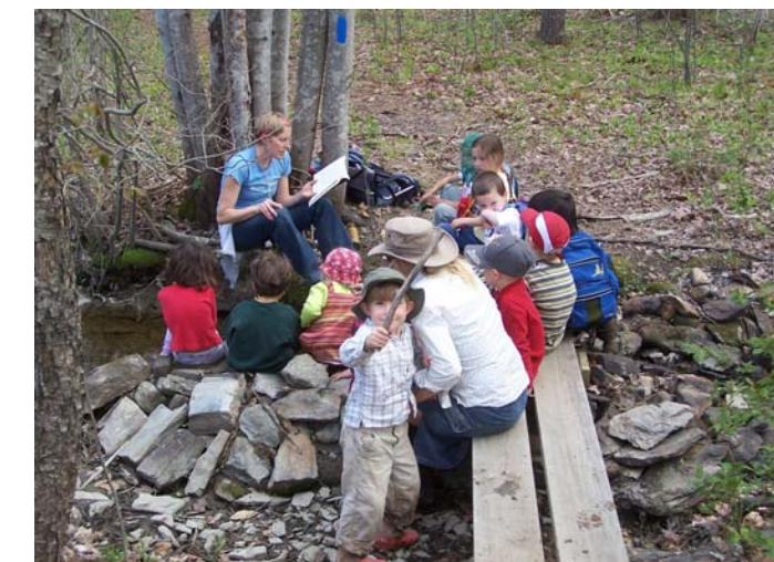
Young Naturalists study plants on the trail

Edwin Way Teal, Journey Into Summer , 1960